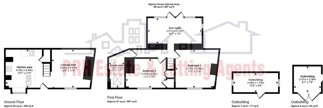
Ground Floor Approx 28 sq m / 300 sq ft